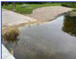
Embankment improvements at Villa Grove