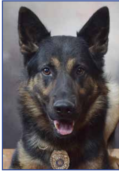
Retired K9 - Iron