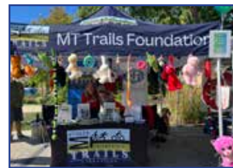
Taste of Mequon Tent