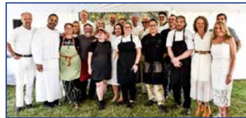
Summer Evening Chef's Table.

SCAN THIS QR CODE TO LEARN MORE ABOUT THE MT TRAILS FOUNDATION AND HELP US CLOSE THE GAP