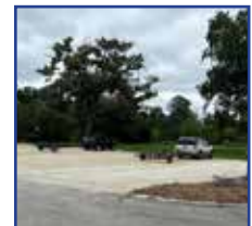
New parking lot at Villa Grove