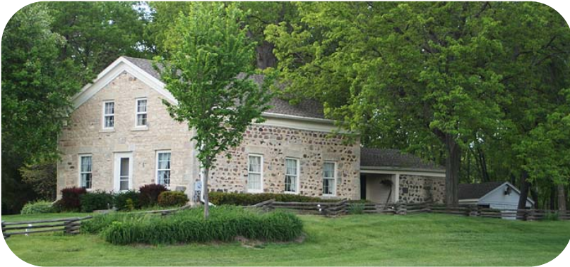
For tours of the historic house please visit http://jonathanclarkhouse.org/

On the National Register of Historic Places